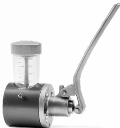
Oil pump for lubricating ball bearings (optional)