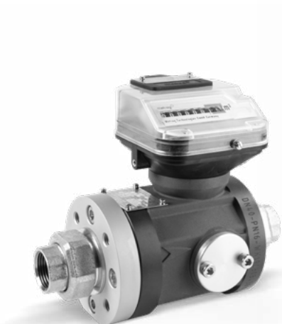
MQM Quantometer (Rp 1" internal thread)

* =The absolute number of the HF pulses depends on the meter size and the individual meter. The stated values are typical sizes. Exact values are determined during calibration of the meter and are stated on the nameplate.